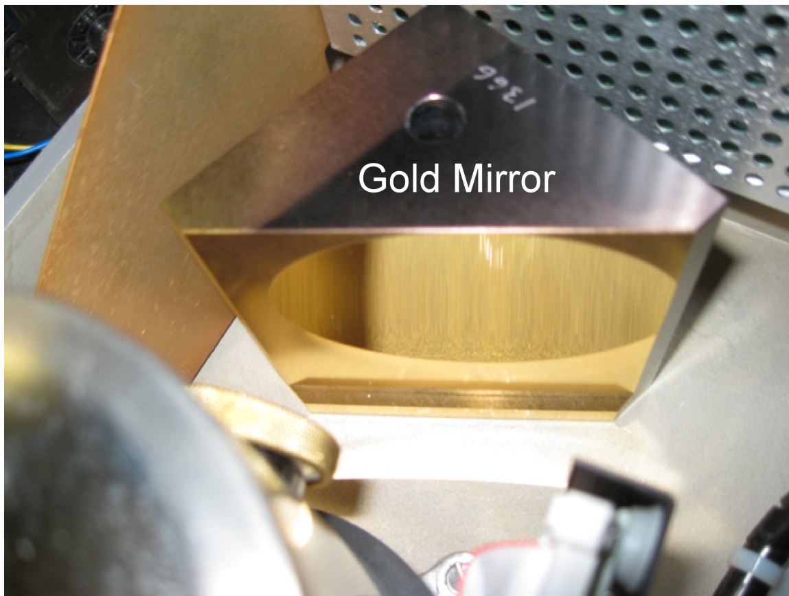
Figure 3. Gold surface mirror.